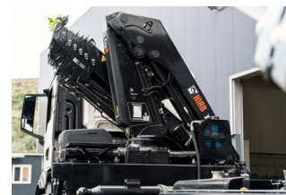
Various crane superstructures