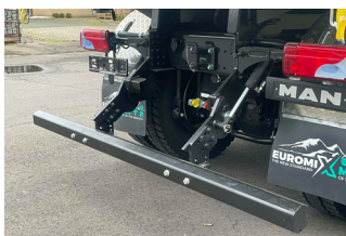
Hydraulic folding underride guard