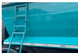
Ascent steps to the tipping bridge