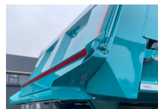
Stoker for asphalt