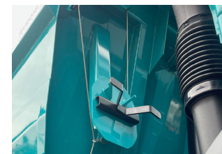
Spare wheel holder