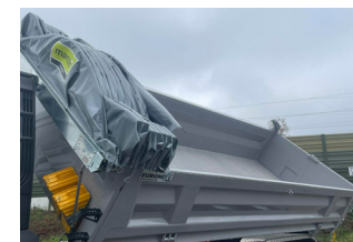
Electrical or mechanical cover