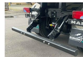
Hydraulic folding underride guard