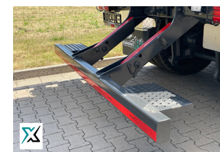
Foldable mechanical underride guard