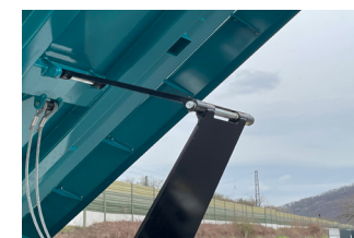
Scissor-type tilt stabilizer