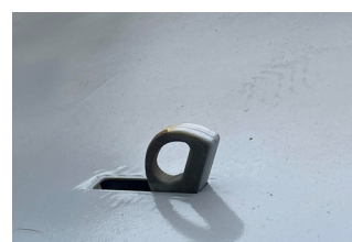
Folding lashing eyes