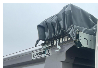
Electrical or mechanical cover