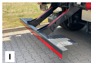
Foldable mechanical underride guard